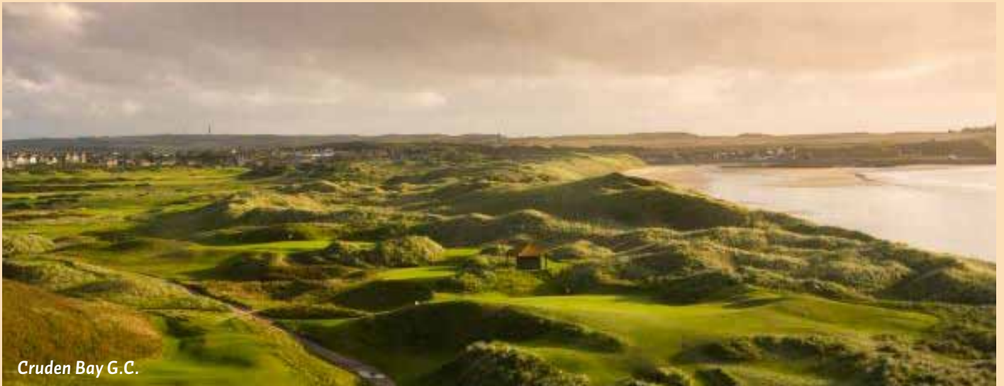
Cruden Bay G.C.