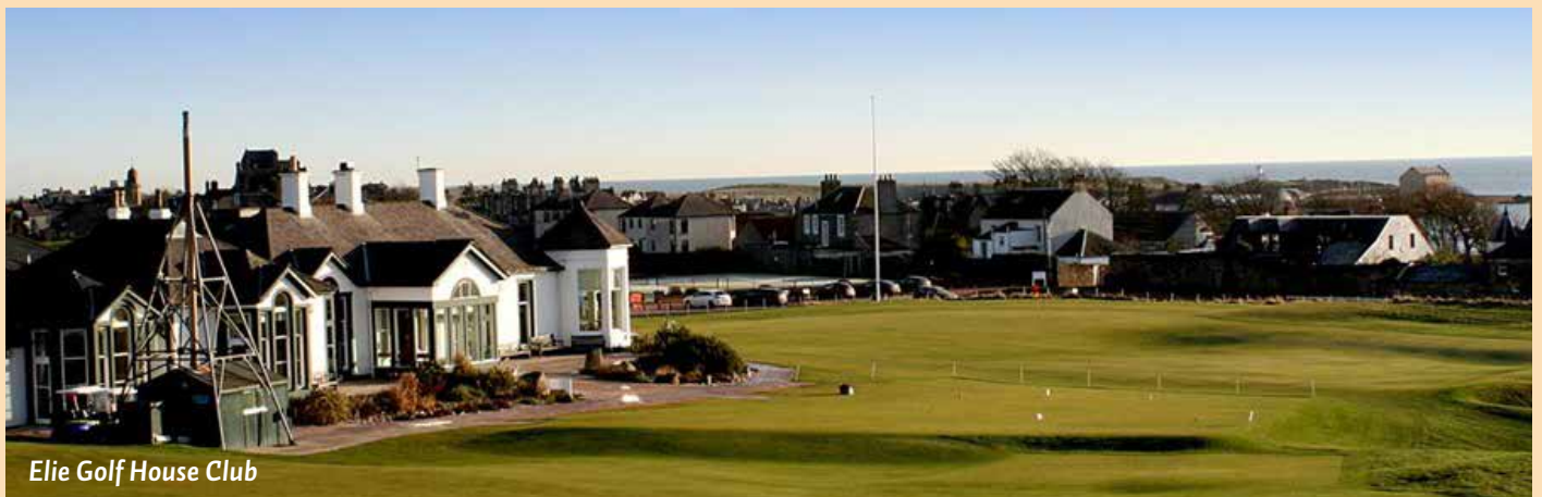
Elie Golf House Club