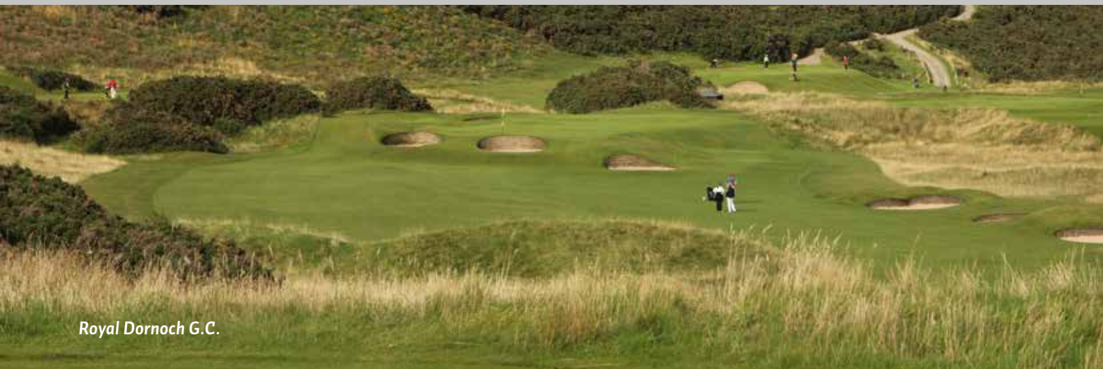
Royal Dornoch G.C.