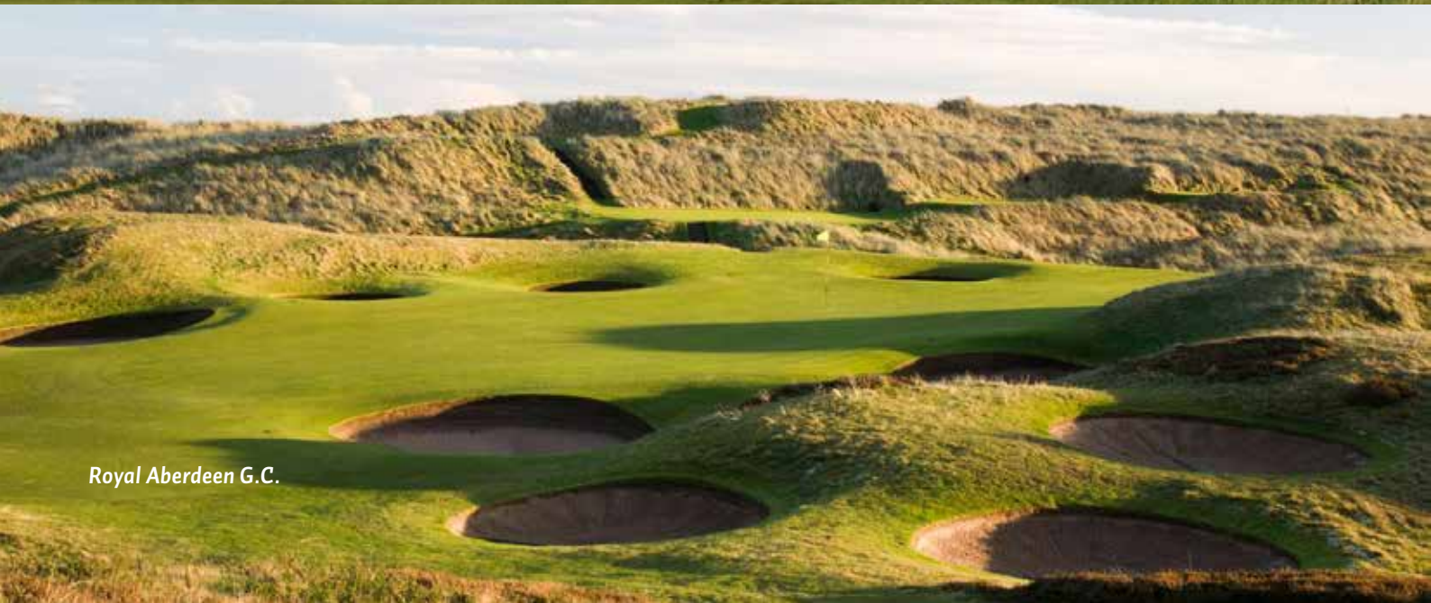
Royal Aberdeen G.C.